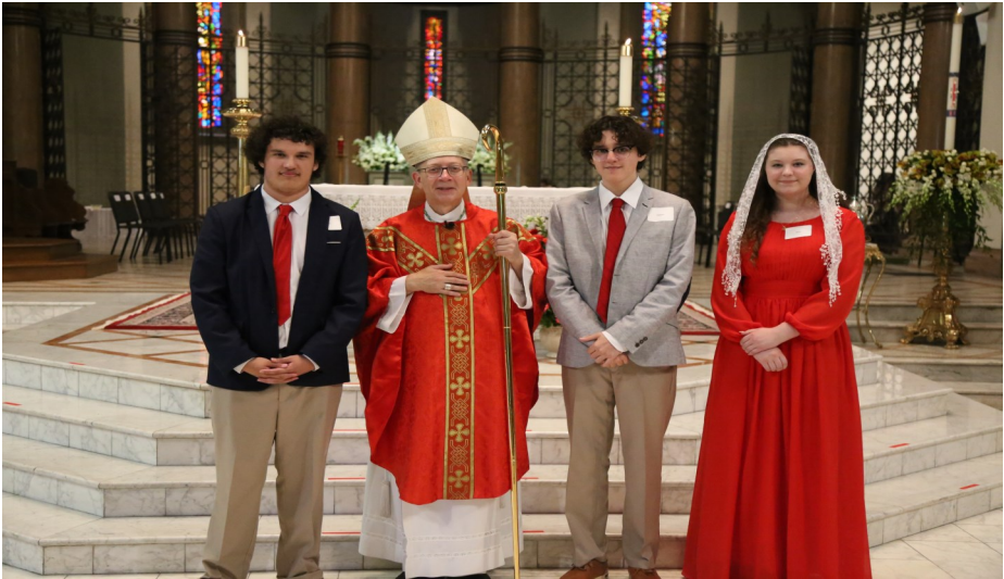
SACRAMENT OF CONFIRMATION, JUNE 8, 2025—CATHEDRAL OF THE SACRED HEART, RICHMOND, VIRGINIA

The Diamond, Richmond, VA - October 11, 2025, 10am-9pm Join Bishop Knestout and the entire diocese at a one-day festival in Richmond. The day will be full of music, food, fun, fellowship and faith and celebrating the Mass as the Diocese of Richmond. Visit our website to learn more: https://catholicfest.richmonddiocese.org/ .