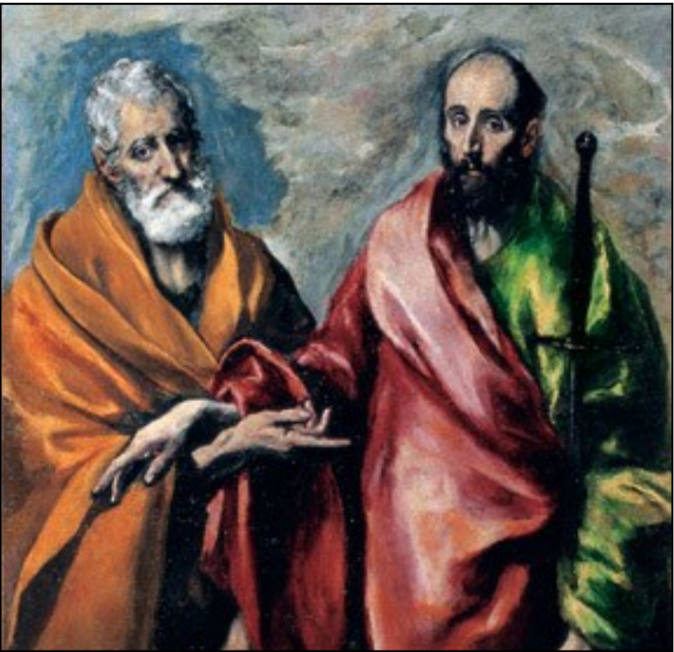
Saint Peter and Saint Paul El Greco (Museu Nacional d'Art de Catalunya, Barcelona), 1595-1600

O God, who on the Solemnity of the Apostles Peter and Paul give us the noble and holy joy of this day, grant, we pray, that your Church may in all things follow the teaching of those through whom she received the beginnings of right religion. Through our Lord Jesus Christ, who lives and reigns with you in the unity of the Holy Spirit, one God, for ever and ever. Amen.