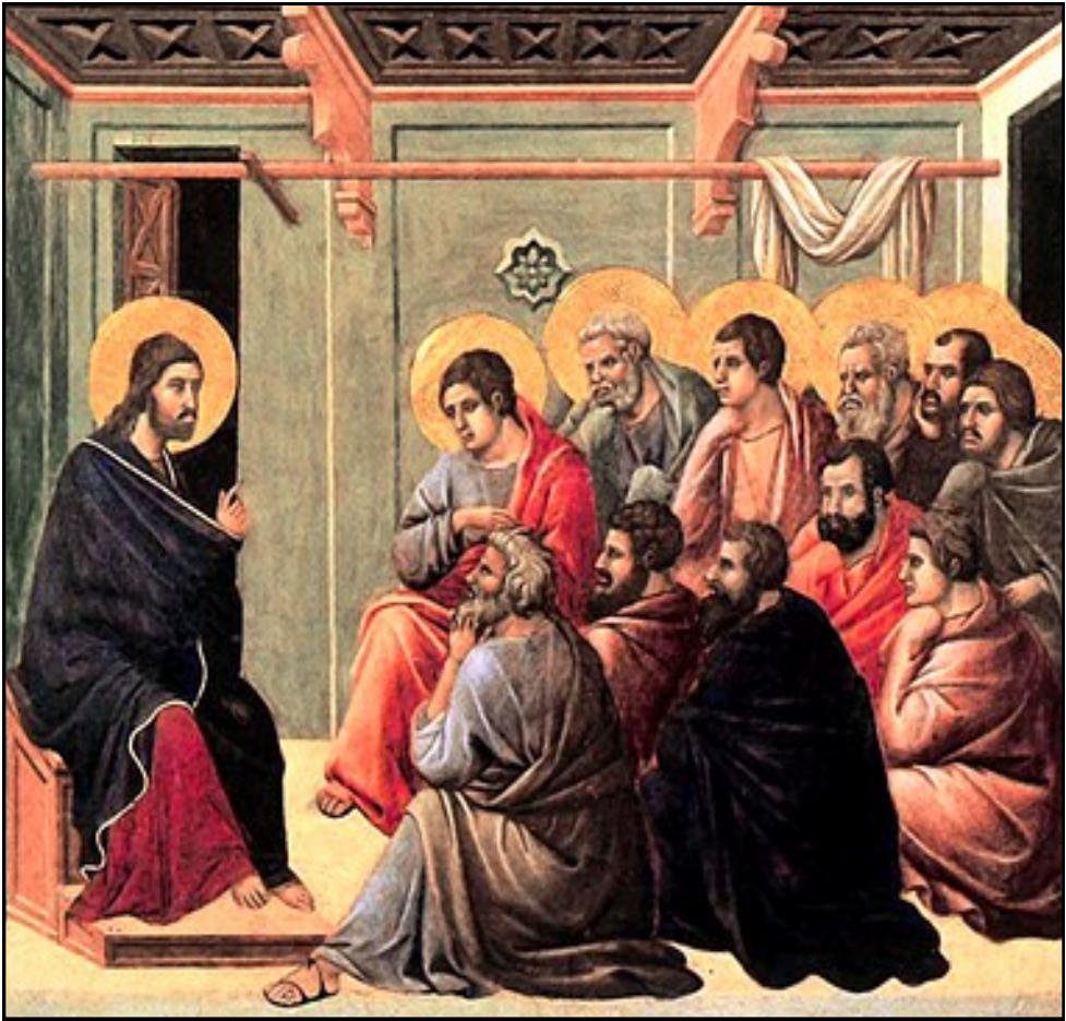
Stories of the Passion (Maestà Altarpiece) Duccio di Buoninsegna, 1308-1311

Through our Lord Jesus Christ, your Son, who lives and reigns with you in the unity of the Holy Spirit, one God, for ever and ever. Amen.