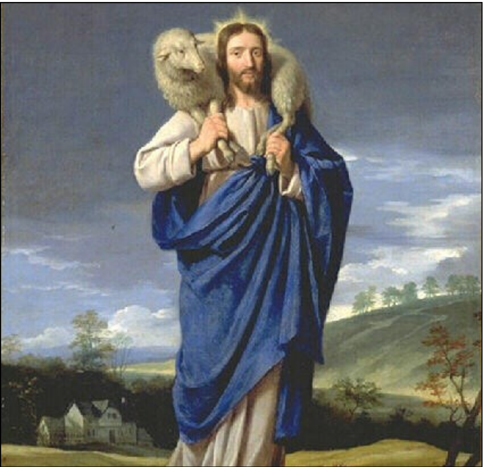
The Good Shepherd Philippe de Champaigne, 17th Century

A lmighty ever-living God, who chose blessed Pope Leo XIV to preside over your whole people and benefit them by word and example, keep safe, we pray, by his intercession, the shepherds of your Church along with the flocks entrusted to their care, and direct them in the way of Eternal salvation. Through our Lord Jesus Christ, your Son, who lives and reigns with you in the unity of the Holy Spirit, one God, for ever and ever. Amen.