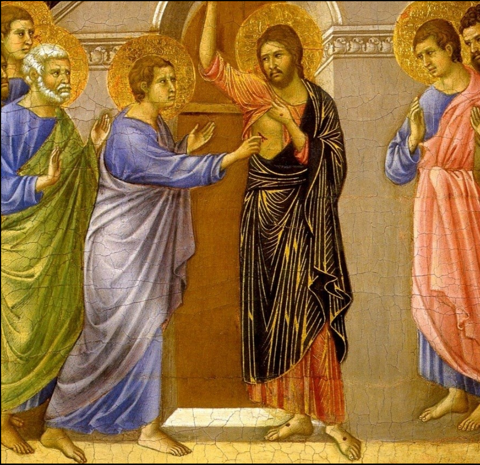
The Incredulity of St. Thomas (Maestà Altarpiece), Duccio di Buoninsegna, 1308-1311

Through our Lord Jesus Christ, your Son, who lives and reigns with you in the unity of the Holy Spirit, one God, for ever and ever. Amen.