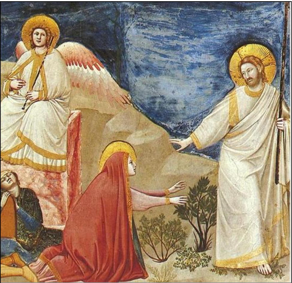
The Resurrection (Cappella degli Scrovegni all’ Arena, Padua, Italy), Giotto di Bondone, 1304-1306

O God, who on this day, through your Only Begotten Son, have conquered death and unlocked for us the path to eternity, grant, we pray, that we who keep the solemnity of the Lord’s Resurrection may through the renewal brought by your Spirit, rise up in the light of life. Who lives and reigns with you in the unity of the Holy Spirit, one God, for ever and ever. Amen.