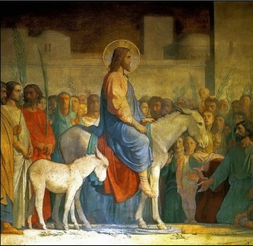
Entry into Jerusalem, Hippolyte Flandrin, 1842

Who lives and reigns with you in the unity of the Holy Spirit, one God, for ever and ever. Amen.