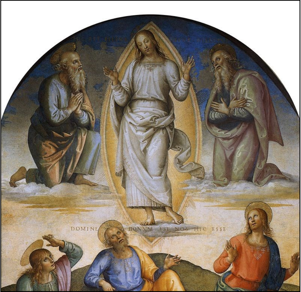
The Transfiguration of Christ (fresco) Pietro Perugino (Collegio del Cambio, Perugia, Italy), 1497-1500

O God, who have commanded us to listen to your beloved Son, be pleased, we pray, to nourish us inwardly by your word, that, with spiritual sight made pure, we may rejoice to behold your glory. Through our Lord Jesus Christ, your Son, who lives and reigns with you in the unity of the Holy Spirit, one God, for ever and ever. Amen.