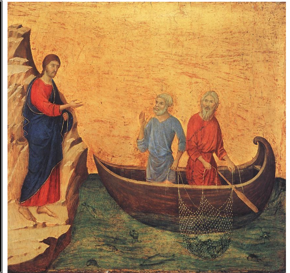
Calling of Saints Peter and Andrew Duccio, 1308-1311

Through our Lord Jesus Christ, your Son, who lives and reigns with you in the unity of the Holy Spirit, one God, for ever and ever. Amen.