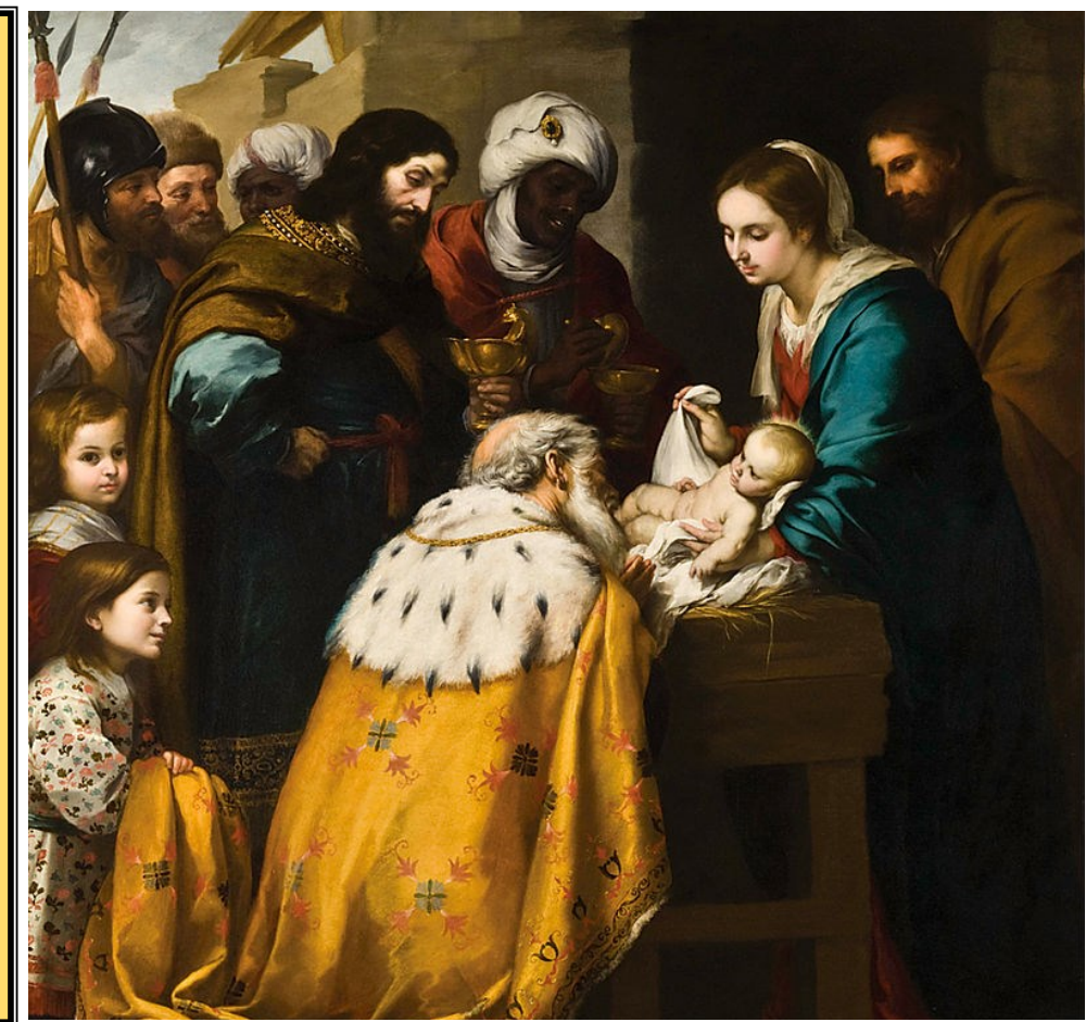
Adoration of the Magi, Bartolomé Esteban Murillo (Toledo Museum of Art, Ohio), 17th Century

Through our Lord, Jesus Christ, your Son, who lives and reigns with you in the unity of the Holy Spirit, one God, for ever and ever. Amen.