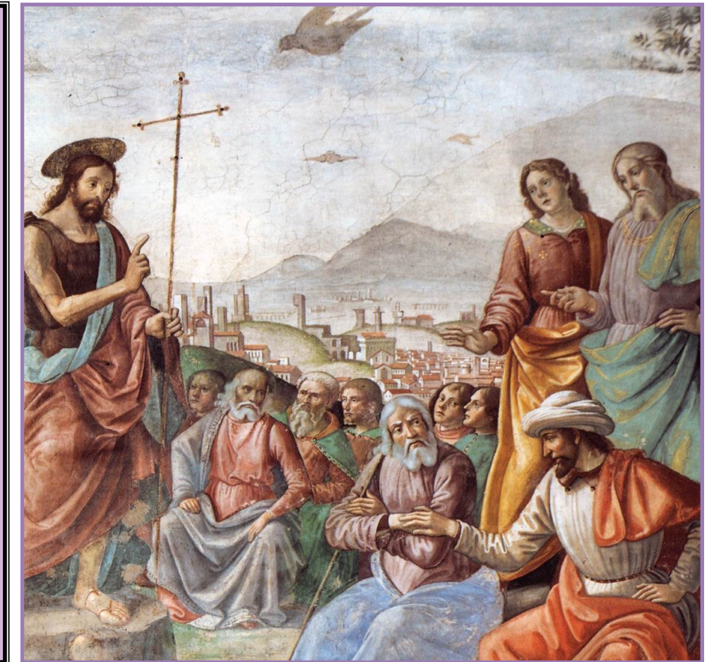
The Preaching of St. John the Baptist Domenico Ghirlandaio (fresco detail), 1486-90

Who lives and reigns with you in the unity of the Holy Spirit, one God, for ever and ever. Amen.