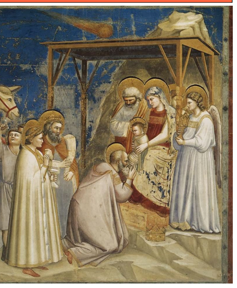
Adoration of the Magi, Giotto di Bondone, 1304-06