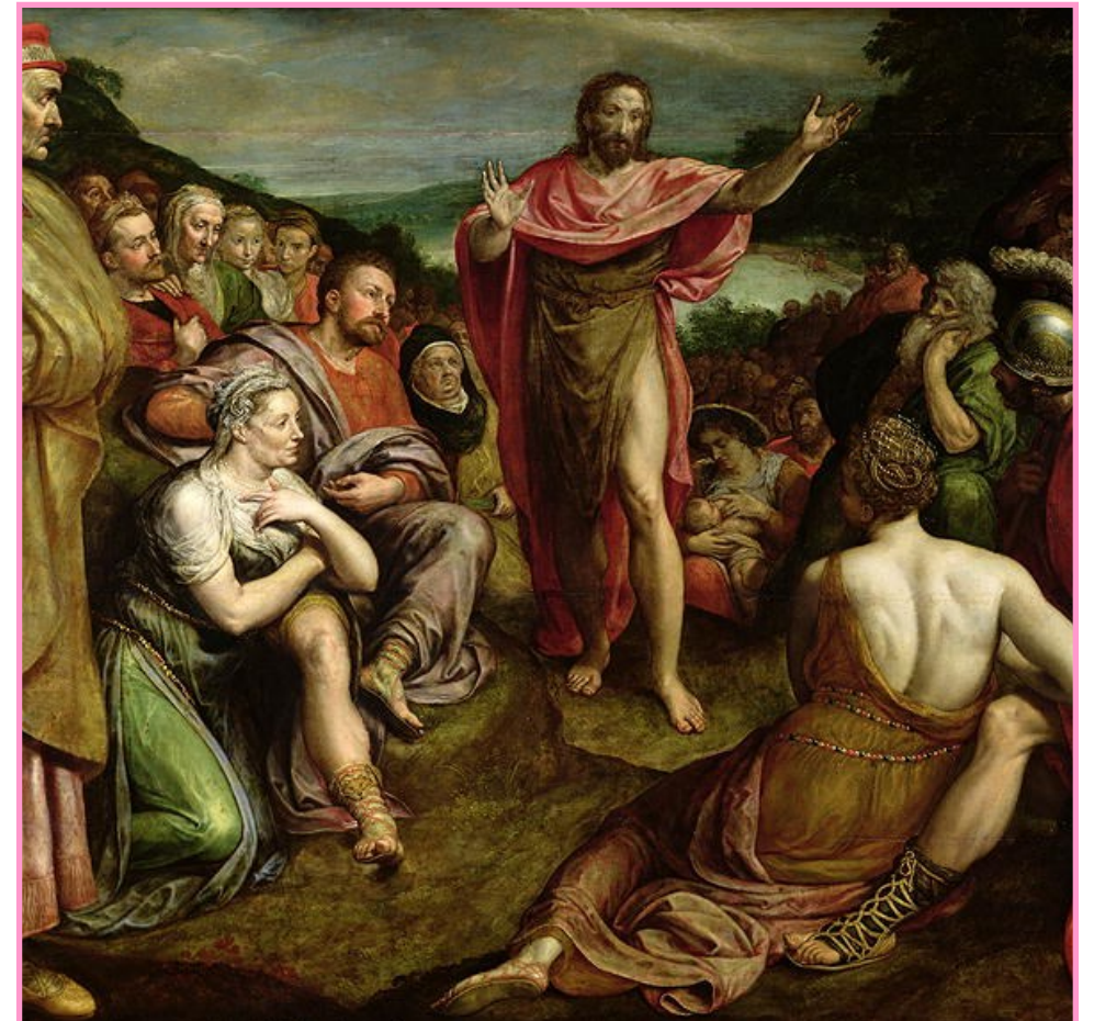
Sermon of St. John the Baptist Frans Pourbus the Elder, 16th Century

Through our Lord Jesus Christ, you Son, who lives and reigns with you in the unity of the Holy Spirit, one God, for ever and ever. Amen.