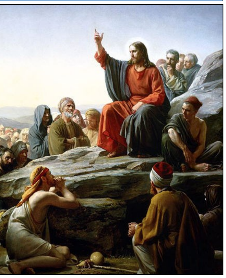
Sermon on the Mount Carl Heinrich Bloch, 1877