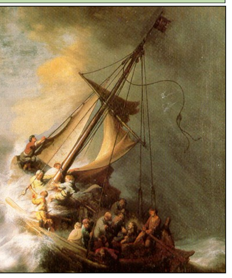
The Storm on the Sea of Galilee Rembrandt van Rijn, 1633

2631 Pocahontas Trail, P.O. Box 648, Quinton, VA 23141 OFFICE: 804-932-4125 FAX: 804-932-8126 RECTORY: 804-557-3962 Email: secretary@seascatholicchurch.org Website: www.seascatholicchurch.org Facebook: facebook.com/SEASCatholic Office Hours: M-F 9:00 AM-2:30 PM