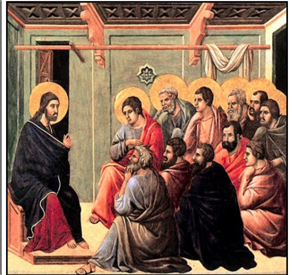
Stories of the Passion (Maestà Altarpiece) Duccio di Buoninsegna, 1308-11

Through our Lord Jesus Christ, your Son, who lives and reigns with you in the unity of the Holy Spirit, one God, for ever and ever. Amen.