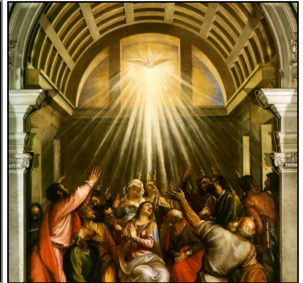
Pentecost Tiziano Vecellio (Titian), 1545

Through our Lord Jesus Christ, your Son, who lives and reigns with you in the unity of the Holy Spirit, one God, for ever and ever. Amen.