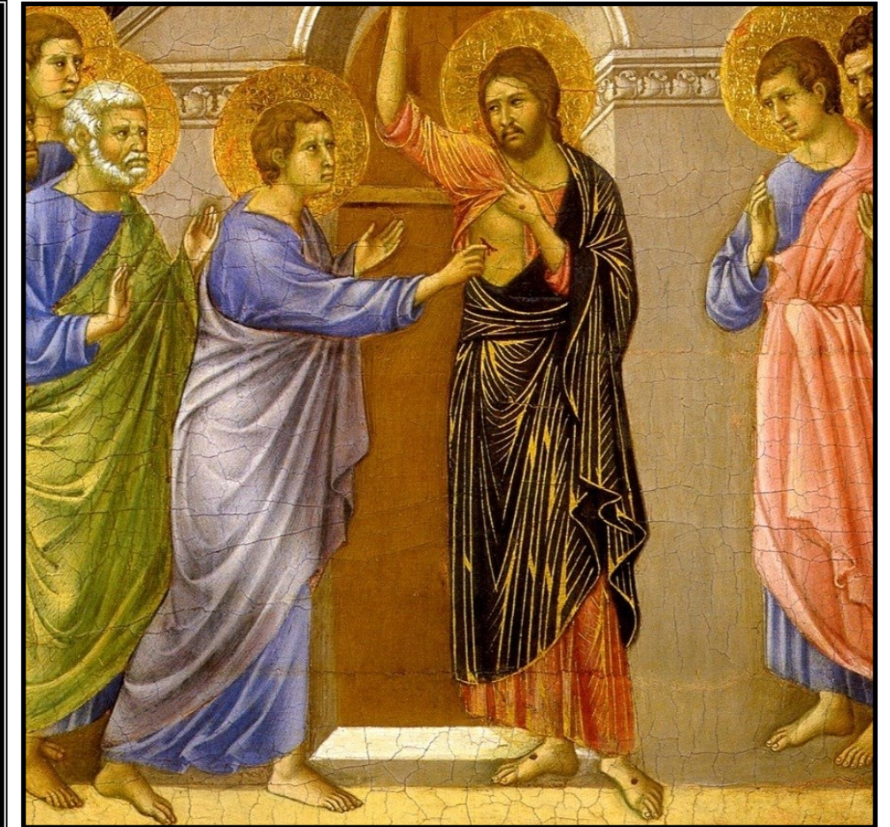
The Incredulity of St. Thomas (Maestà Altarpiece) Duccio di Buoninsegna, 1308-11

Through our Lord Jesus Christ, your Son, who lives and reigns with you in the unity of the Holy Spirit, one God, for ever and ever. Amen.