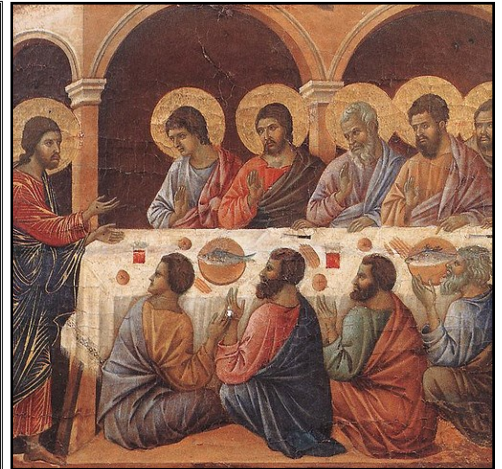
Appearance of Christ to the Apostles (Maestà Altarpiece) Duccio di Buoninsegna, 1308-11

Through our Lord Jesus Christ, your Son, who lives and reigns with you in the unity of the Holy Spirit, one God, for ever and ever. Amen.