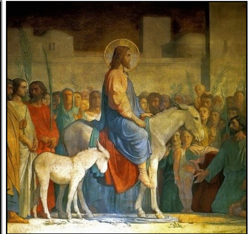
Entry into Jerusalem, Hippolyte Flandrin, 1842

Who lives and reigns with you in the unity of the Holy Spirit, one God, for ever and ever. Amen.