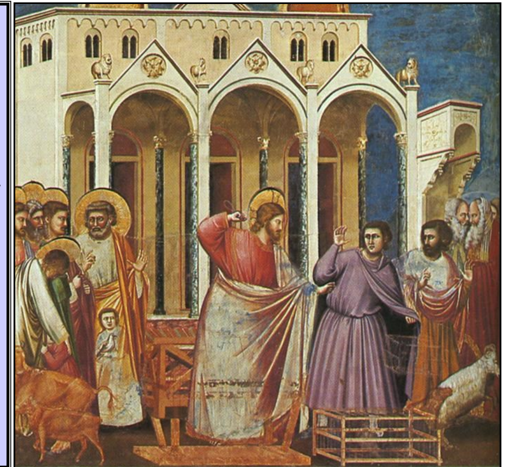
Expulsion of the Money-changers from the Temple (fresco), Giotto di Bondone (Scenes from the Life of Christ), 1304

Through our Lord, Jesus Christ, your Son, who lives and reigns with you in the unity of the Holy Spirit, one God, for ever and ever. Amen.