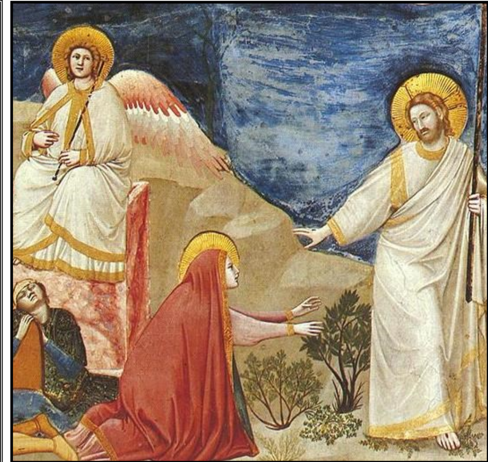
The Resurrection (Cappella degli Scrovegni all’ Arena, Padua, Italy), Giotto di Bondone, 1304-1306

Who lives and reigns with you in the unity of the Holy Spirit, one God, for ever and ever. Amen.