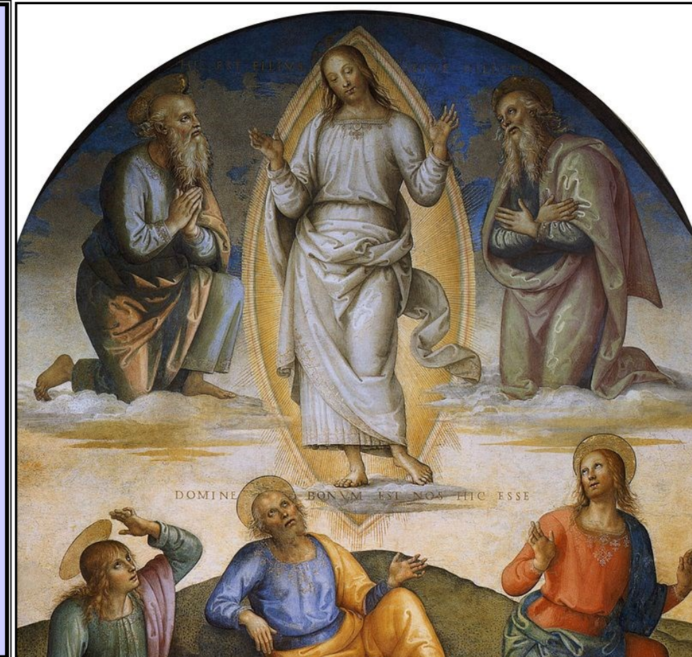
The Transfiguration of Christ (fresco), Pietro Perugino (Collegio del Cambio, Perugia, Italy), 1497-1500

Through our Lord, Jesus Christ, your Son, who lives and reigns with you in the unity of the Holy Spirit, one God, for ever and ever. Amen.