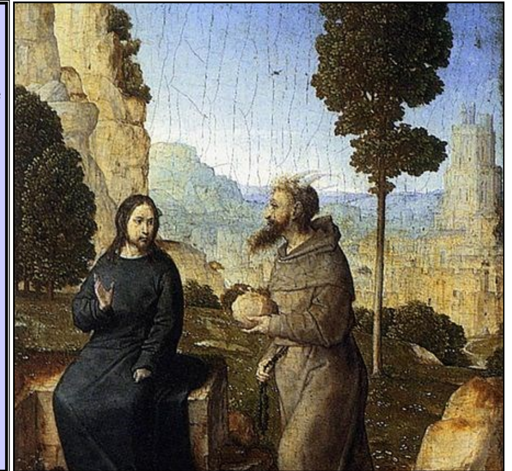
The Temptation of Christ, Juan de Flandes, 1500

Through our Lord, Jesus Christ, your Son, who lives and reigns with you in the unity of the Holy Spirit, one God, for ever and ever. Amen.