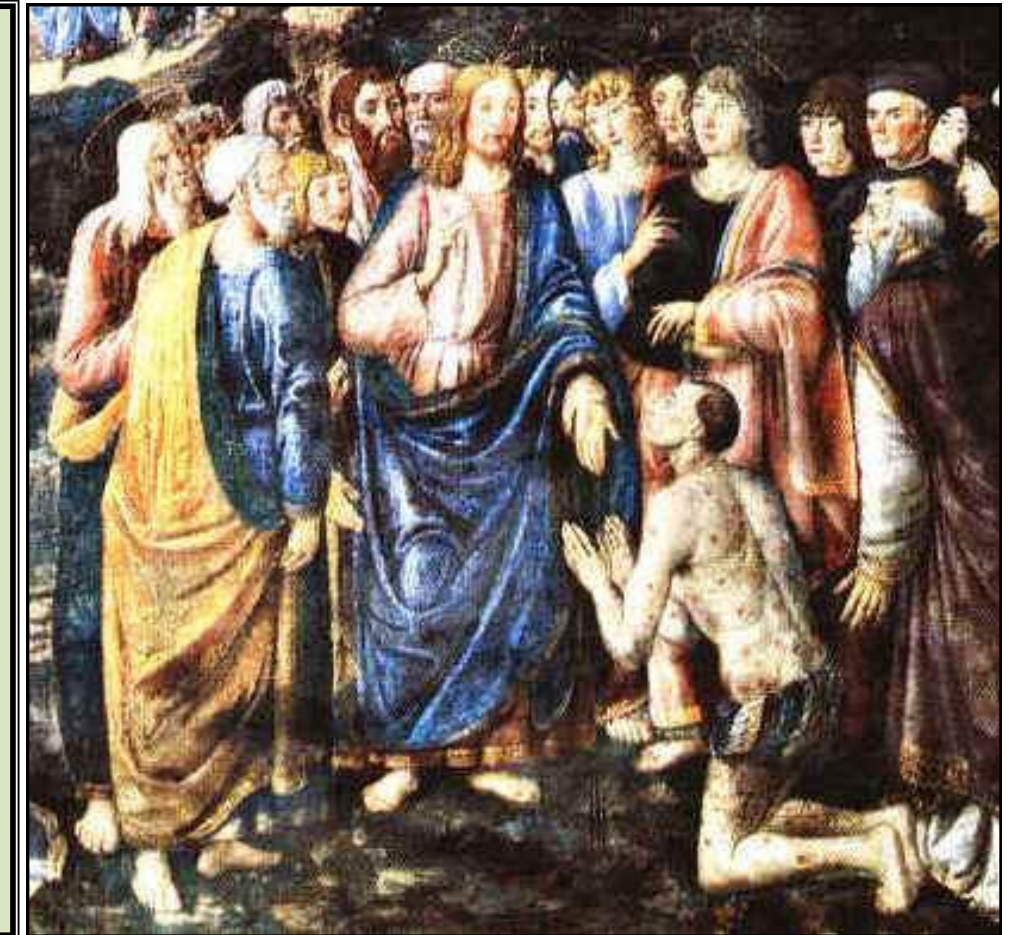
Sermon on the Mount and the Healing of the Leper, Piero Di Cosimo, 1481-82

Through our Lord, Jesus Christ, your Son, who lives and reigns with you in the unity of the Holy Spirit, one God, for ever and ever. Amen.