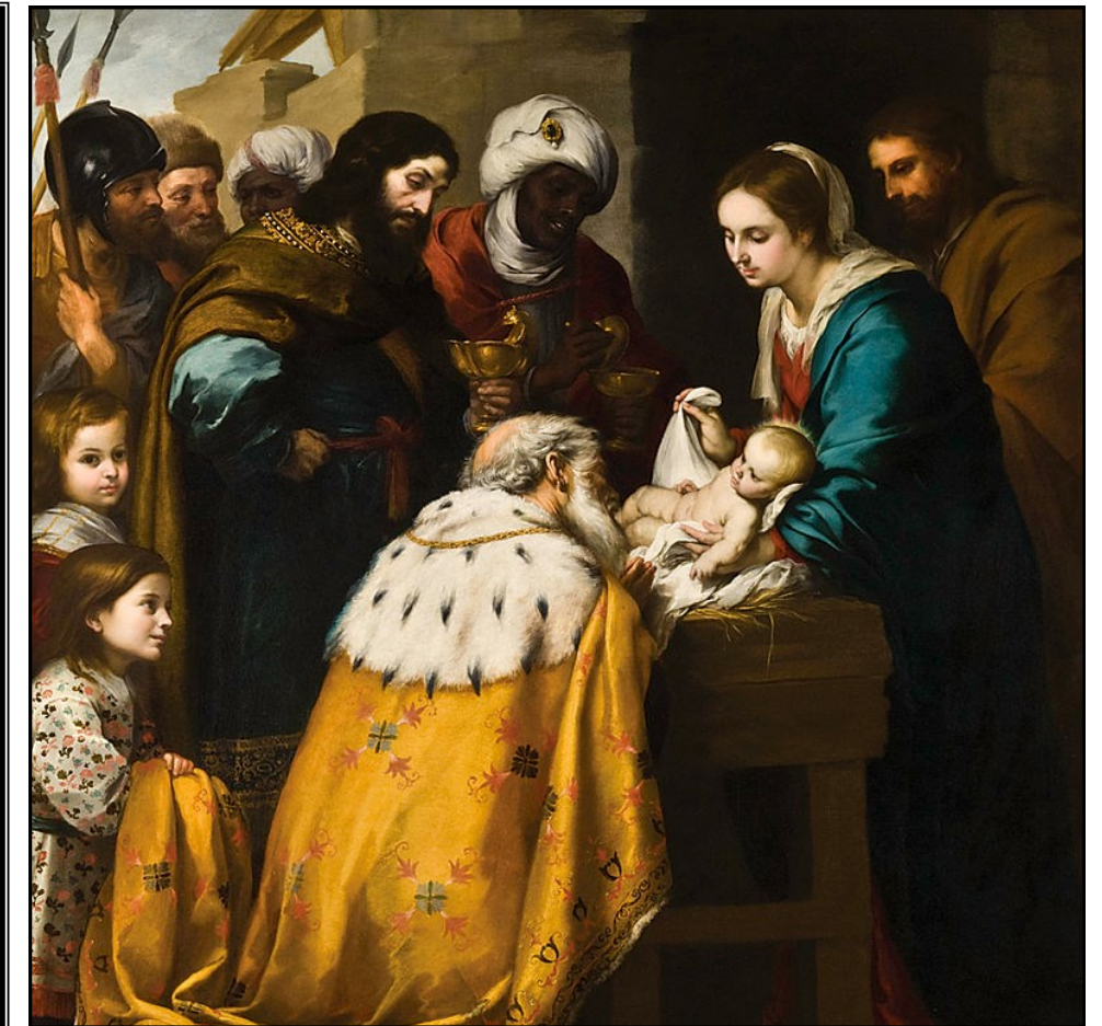
Adoration of the Magi, Bartolomé Esteban Murillo (Toledo Museum of Art, Ohio), 17th Century

Through our Lord, Jesus Christ, your Son, who lives and reigns with you in the unity of the Holy Spirit, one God, for ever and ever. Amen.