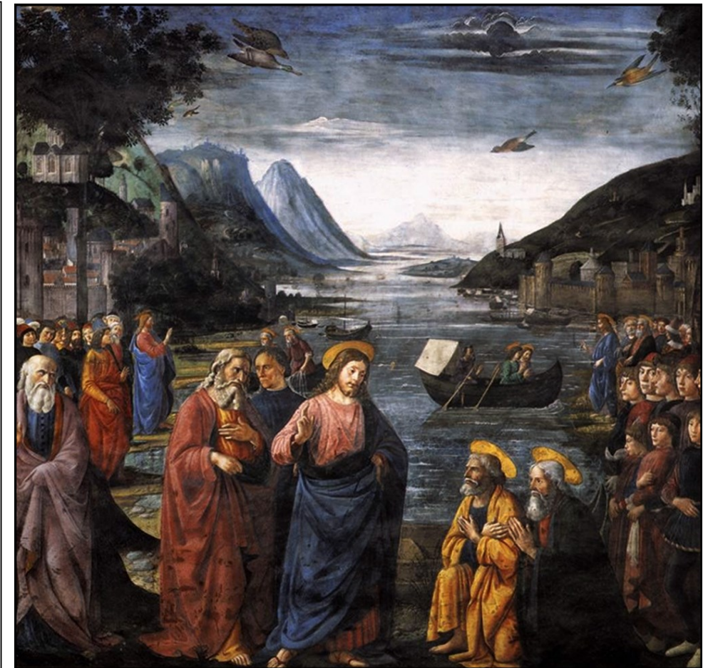
Vocation of the Apostles, Domenico Ghirlandaio (partial fresco, Sistine Chapel, Rome), 1481-82

Through our Lord, Jesus Christ, your Son, who lives and reigns with you in the unity of the Holy Spirit, one God, for ever and ever. Amen.