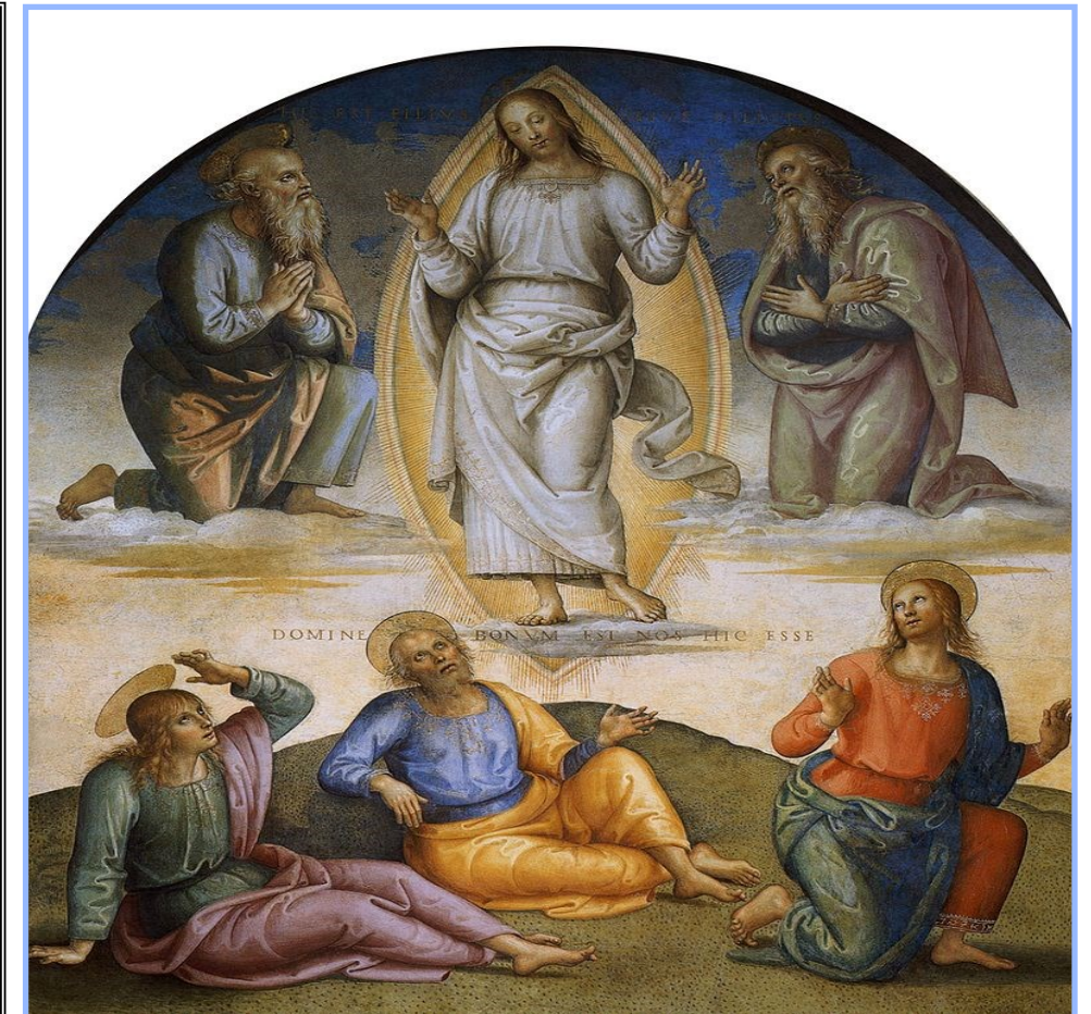
Transfiguration (fresco), Collegio del Cambio, Pérouse Pietro Perugino, 1497-1500

Who lives and reigns with you in the unity of the Holy Spirit, one God for ever and ever. Amen.