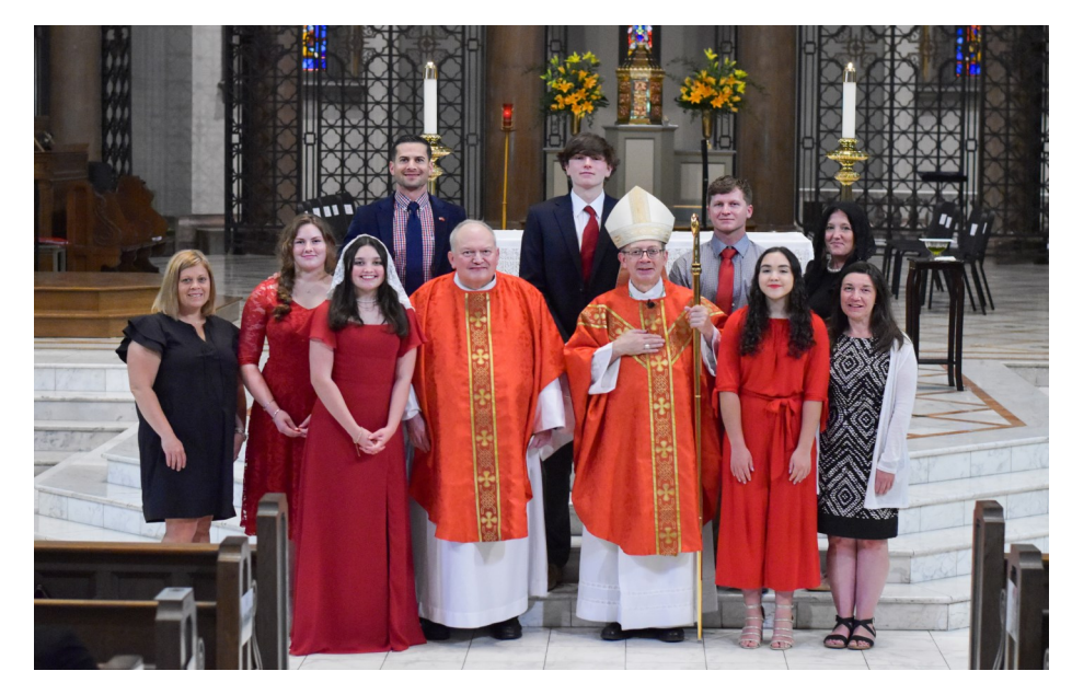
Sacrament of Confirmation—Cathedral of the Sacred Heart, May 28, 2023.