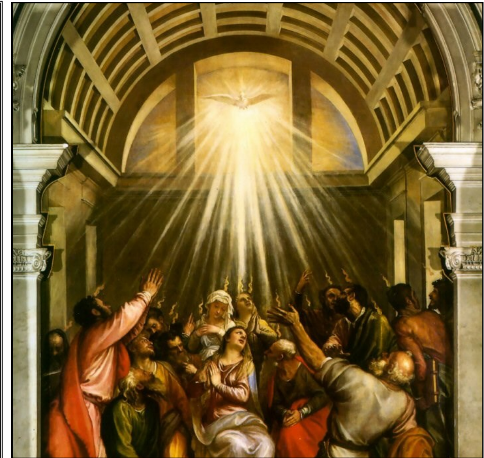
Pentecost Tiziano Vecellio (Titian), 1545

Through our Lord Jesus Christ, your Son, who lives and reigns with you in the unity of the Holy Spirit, one God, for ever and ever. Amen.