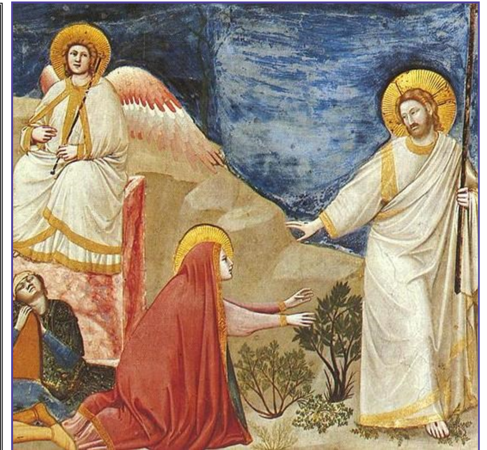
The Resurrection (Cappella degli Scrovegni all' Arena, Padua, Italy) Giotto di Bondone, 1304-1306

Who lives and reigns with you in the unity of the Holy Spirit, one God, for ever and ever. Amen.