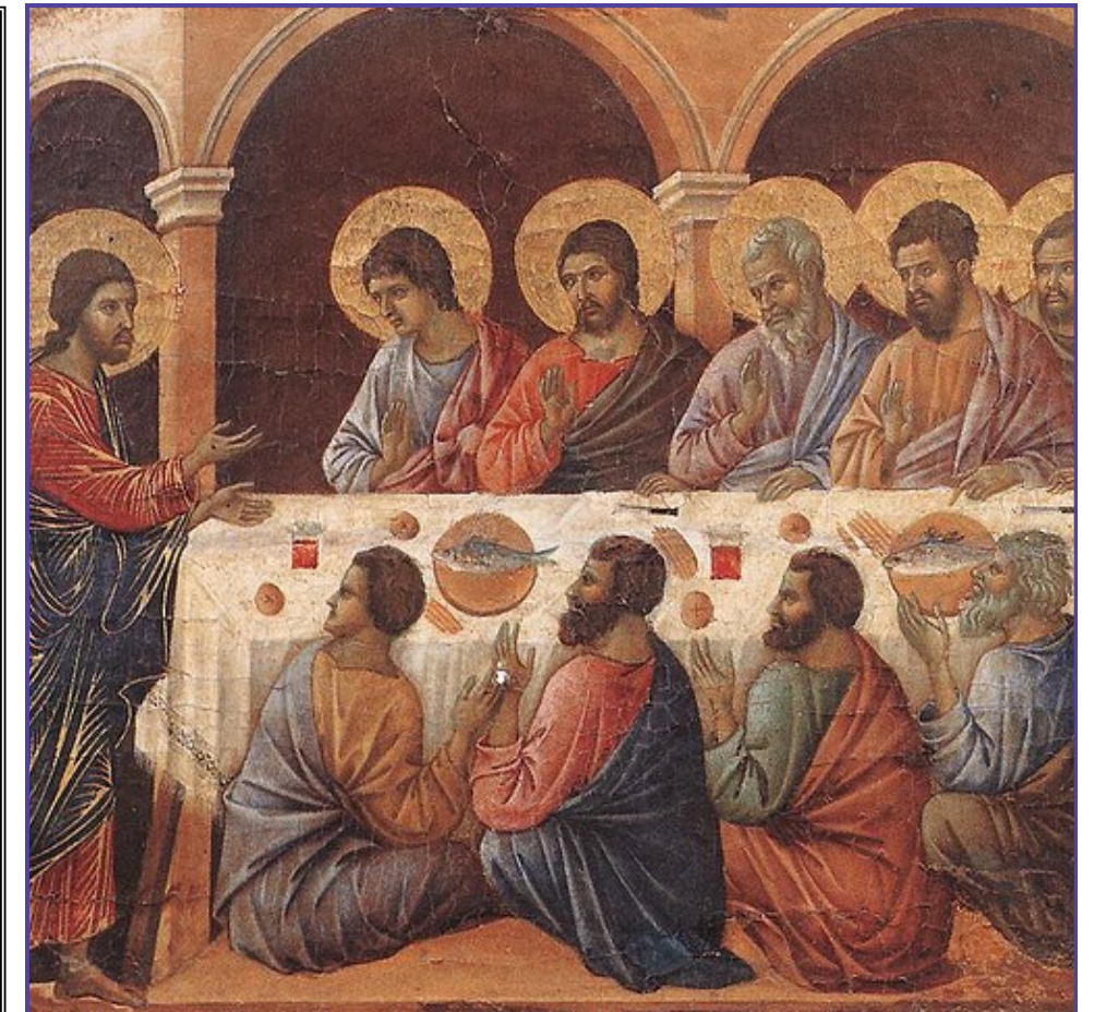
Appearance of Christ to the Apostles (Maestà Altarpiece), Duccio di Buoninsegna, 1308-11

Through our Lord Jesus Christ, your Son, who lives and reigns with you in the unity of the Holy Spirit, one God, for ever and ever. Amen.