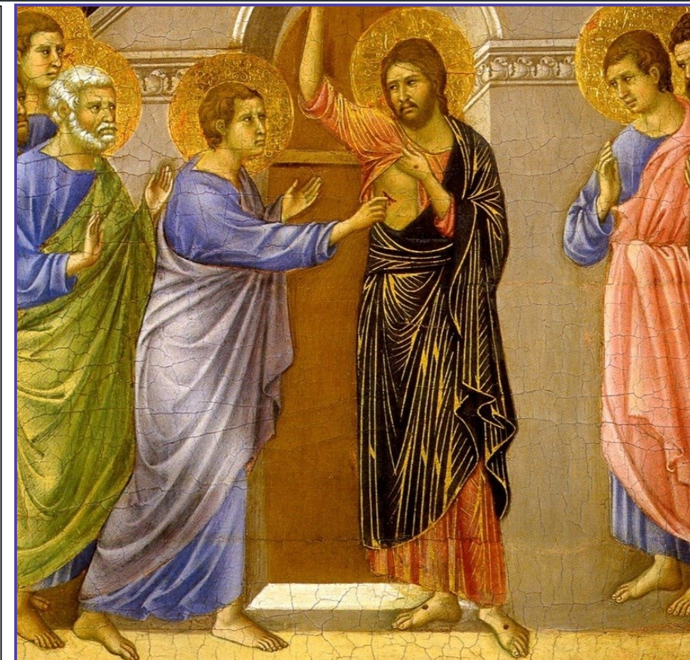
The Incredulity of St. Thomas (Maestà Altarpiece) Duccio di Buoninsegna, 1308-11

Through our Lord Jesus Christ, your Son, who lives and reigns with you in the unity of the Holy Spirit, one God, for ever and ever. Amen.