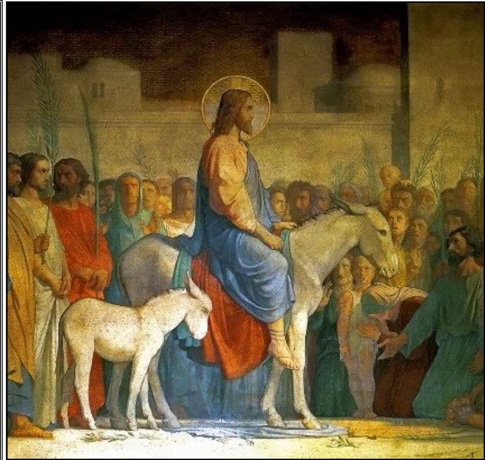
Entry into Jerusalem Hippolyte Flandrin, 1842

Almighty ever-living God, who as an example of humility for the human race to follow caused our Savior to take flesh and submit to the Cross, graciously grant that we may heed his lesson of patient suffering and so merit a share in his Resurrection. Who lives and reigns with you in the unity of the Holy Spirit, one God, for ever and ever. Amen.