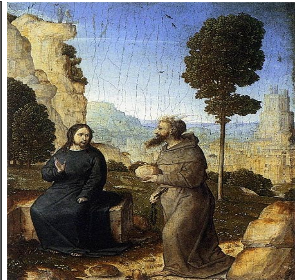
The Temptation of Christ Juan de Flandes, 1500

Through our Lord Jesus Christ, your Son, who lives and reigns with you in the unity of the Holy Spirit, one God, for ever and ever. Amen.