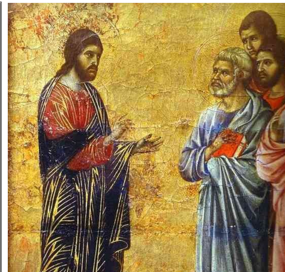
Maestà (detail of back crowning panel) Duccio di Buoninsegna, 1308-11

Grant, we pray, almighty God, that, always pondering spiritual things, we may carry out in both word and deed that which is pleasing to you. Through our Lord Jesus Christ, your Son, who lives and reigns with you in the unity of the Holy Spirit, one God, for ever and ever. Amen.