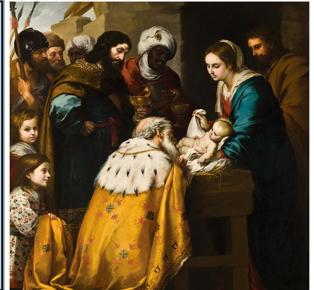
Adoration of the Magi (Bartolomé Esteban Murillo, Toledo Museum of Art, Ohio), 17th Century

Through our Lord Jesus Christ, your Son, who lives and reigns with you in the unity of the Holy Spirit, one God, for ever and ever. Amen.