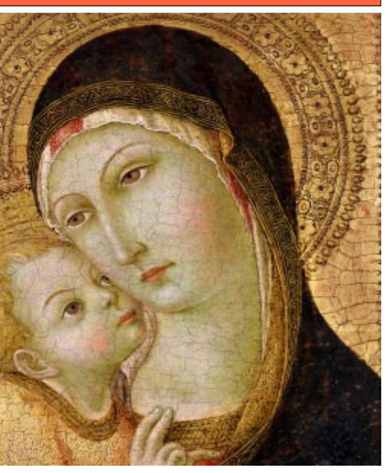
Madonna and Child, Sano di Pietro, 1406-81

WEEKEND MASS SCHEDULE: Saturday Vigil: 5:30 PM; Sunday: 8:30 AM & 11:00 AM The Sacrament of Reconciliation is offered Saturdays at 5:00 PM and by appointment.