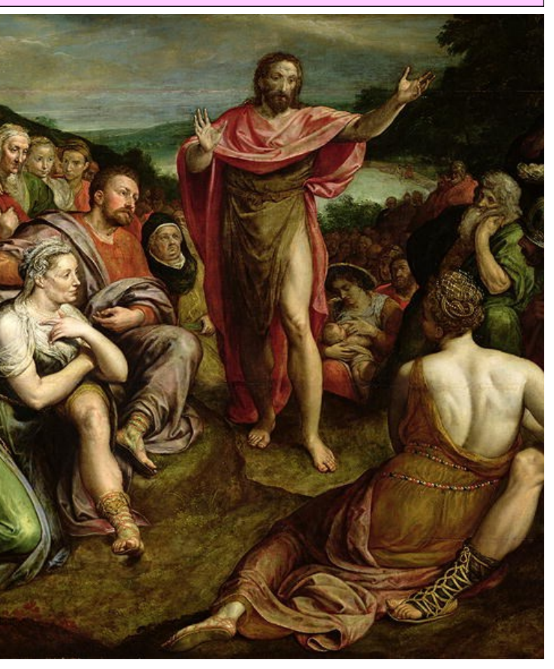
Sermon of St. John the Baptist, 16th Century Frans Pourbus the Elder

2631 Pocahontas Trail, P.O. Box 648, Quinton, VA 23141 OFFICE: 804-932-4125 FAX: 804-932-8126 RECTORY: 804-557-3962 Email: secretary@seascatholicchurch.org Website: www.seascatholicchurch.org Facebook: facebook.com/SEASCatholic Office Hours: M-F 9:00 AM-2:30 PM