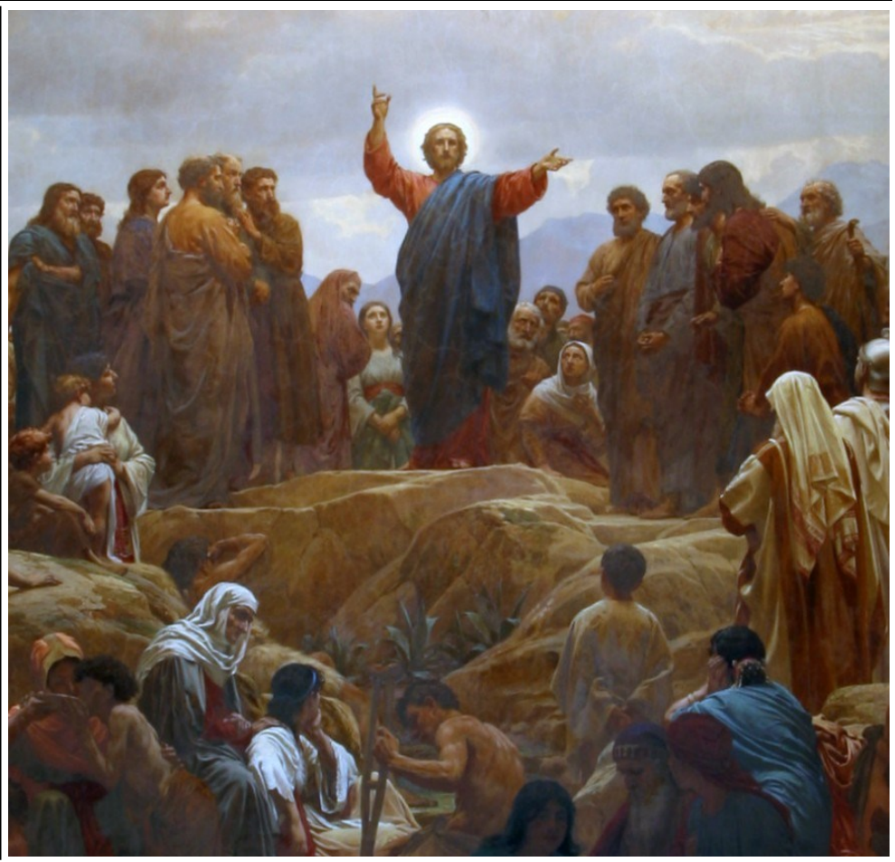
Through our Lord Jesus Christ, your Son, who lives and reigns with you in the unity of the Holy Spirit, one God, for ever and ever. Amen.

May your grace, O Lord, we pray. at all times go before us and follow after and make us always determined to carry out good works.