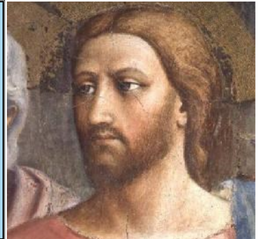
Christ (detail from fresco), Masaccio, Brancacci Chapel, Florence, 1420s

Through our Lord Jesus Christ, your Son, who lives and reigns with you in the unity of the Holy Spirit, one God, for ever and ever. Amen.