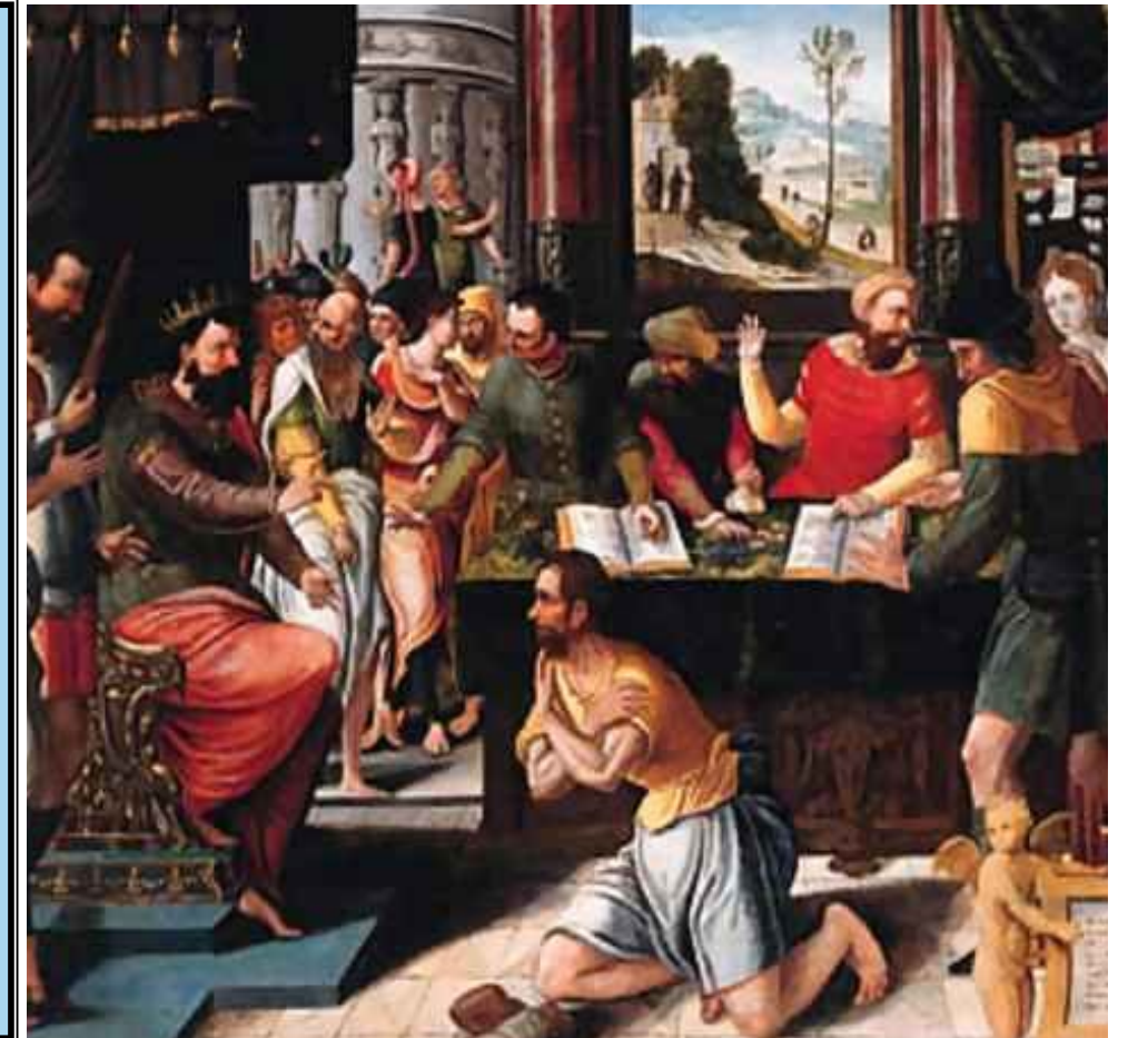
The Parable of the Unmerciful Servant Pieter Coecke Van Aelst, 1502-1550

Almighty ever-living God, whom, taught by the Holy Spirit, we dare to call our Father, bring, we pray, to perfection in our hearts the spirit of adoption as your sons and daughters, that we may merit to enter into the inheritance which you have promised. Through our Lord Jesus Christ, your Son, who lives and reigns with you in the unity of the Holy Spirit, one God, for ever and ever. Amen.