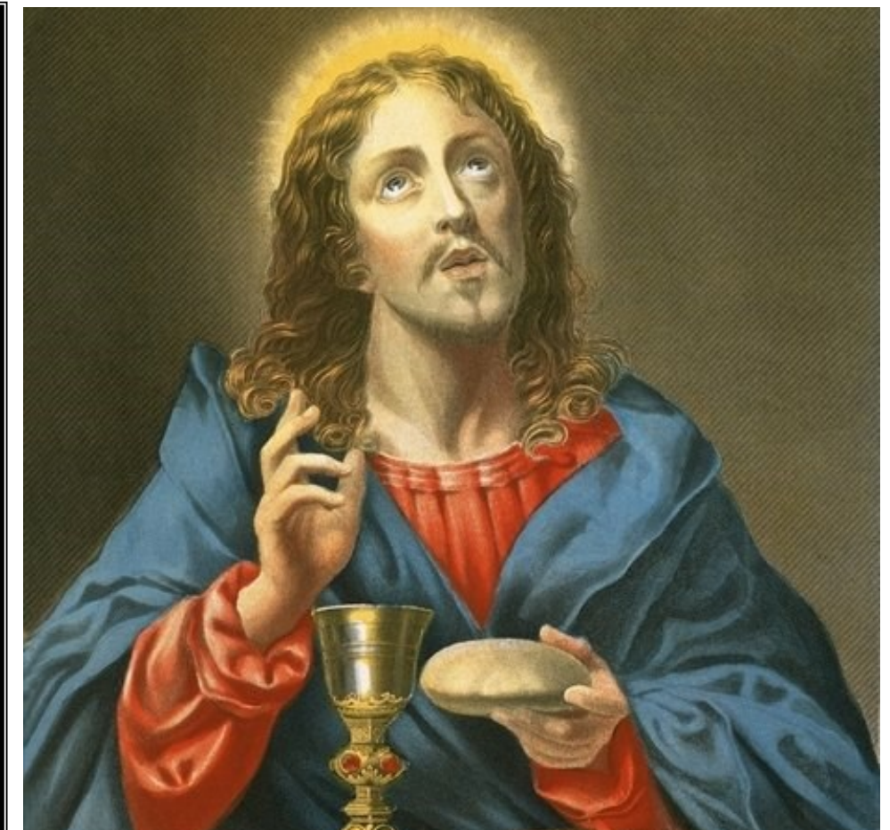
The Redeemer Carlo Dolci, 1616-1686

Through our Lord Jesus Christ, your Son, who lives and reigns with you in the unity of the Holy Spirit, one God, for ever and ever. Amen.