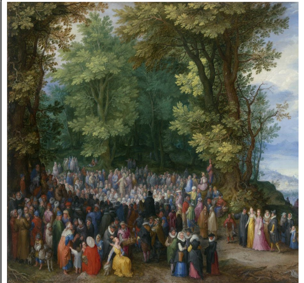
Sermon on the Mount Jan Brueghel the Elder, 1598

Through our Lord Jesus Christ, your Son, who lives and reigns with you in the unity of the Holy Spirit, one God, for ever and ever. Amen.