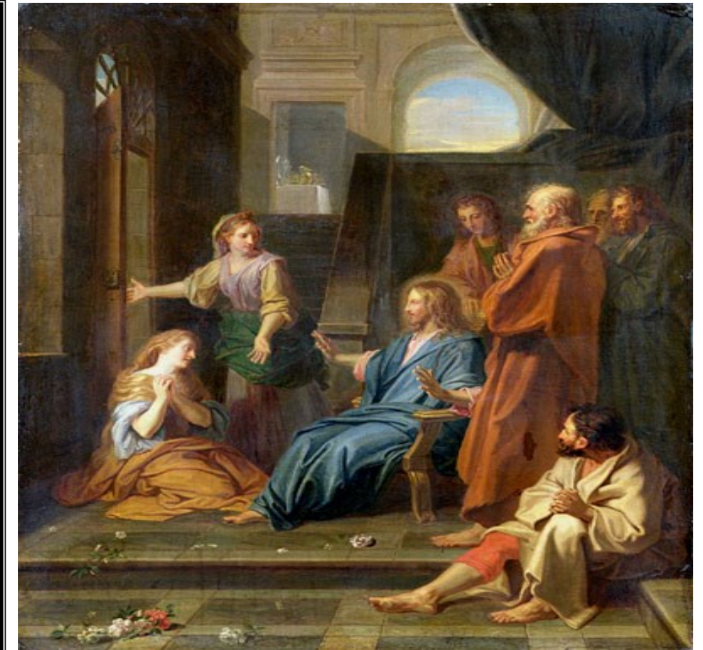
Christ in the House of Martha and Mary Jean-Baptiste Jouvenet, 1644-1717

Through our Lord Jesus Christ, your Son, who lives and reigns with you in the unity of the Holy Spirit, one God, for ever and ever. Amen.