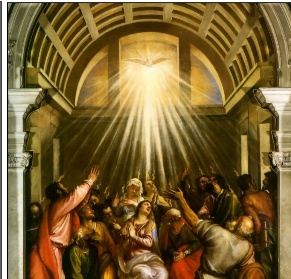
Pentecost Tiziano Vecellio (Titian), 1545

Through our Lord Jesus Christ, your Son, who lives and reigns with you in the unity of the Holy Spirit, one God, for ever and ever. Amen.