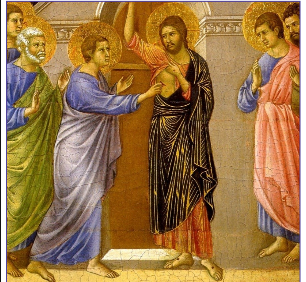
The Incredulity of St. Thomas (Maestà Altarpiece), Duccio di Buoninsegna, 1308-11

Through our Lord Jesus Christ, your Son, who lives and reigns with you in the unity of the Holy Spirit, one God, for ever and ever. Amen.