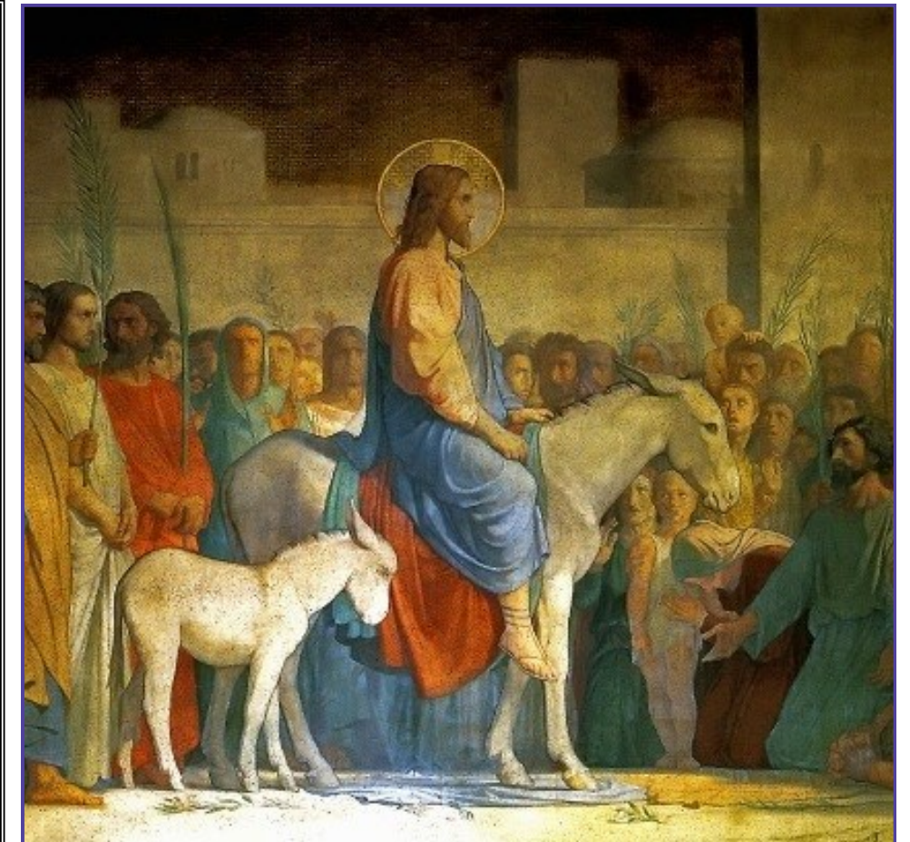
Entry into Jerusalem, Hippolyte Flandrin 1842

Who lives and reigns with you in the unity of the Holy Spirit, one God, for ever and ever. Amen.