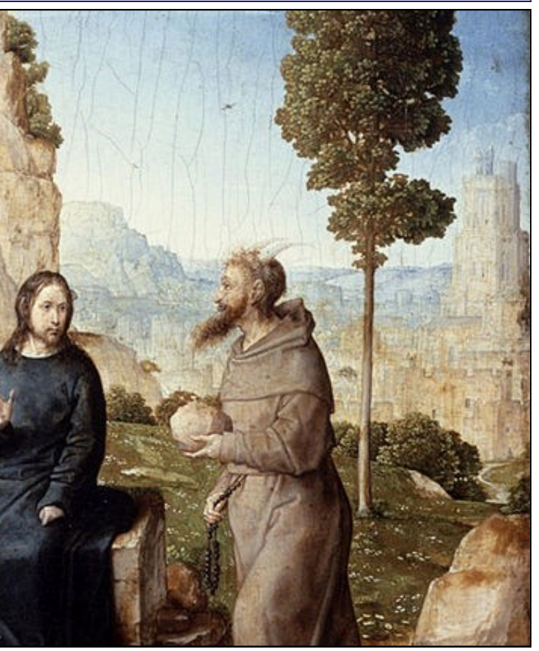
The Temptation of Christ in the Wilderness Juan de Flandes. 1500-04

2631 Pocahontas Trail, P.O. Box 648, Quinton, VA 23141 OFFICE: 804-932-4125 FAX: 804-932-8126 RECTORY: 804-557-3962 Email: secretary@seascatholicchurch.org Website: www.seascatholicchurch.org Facebook: facebook.com/SEASCatholic Office Hours: M-F 9:00 AM-2:30 PM