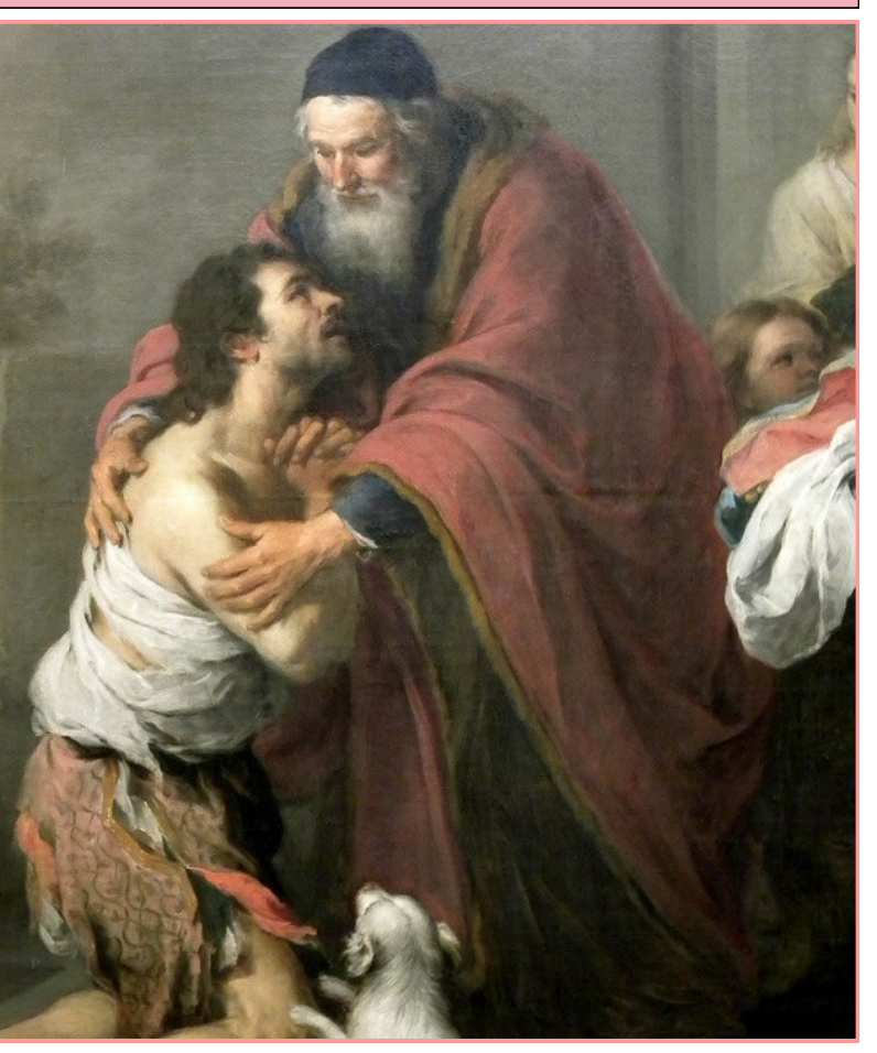
The Return of the Prodigal Son (detail) Murillo, 1667-70

2631 Pocahontas Trail, P.O. Box 648, Quinton, VA 23141 OFFICE: 804-932-4125 FAX: 804-932-8126 RECTORY: 804-557-3962 Email: secretary@seascatholicchurch.org Website: www.seascatholicchurch.org Facebook: facebook.com/SEASCatholic Office Hours: M-F 9:00 AM-2:30 PM