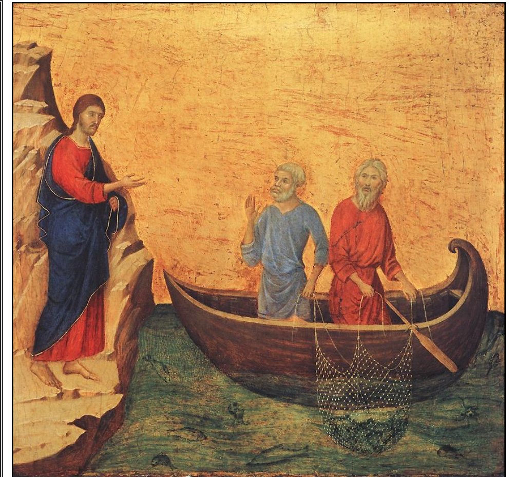
Calling of Sts. Peter and Andrew Duccio, 1308-1311

Through our Lord Jesus Christ, your Son, who lives and reigns with you in the unity of the Holy Spirit, one God, for ever and ever. Amen.